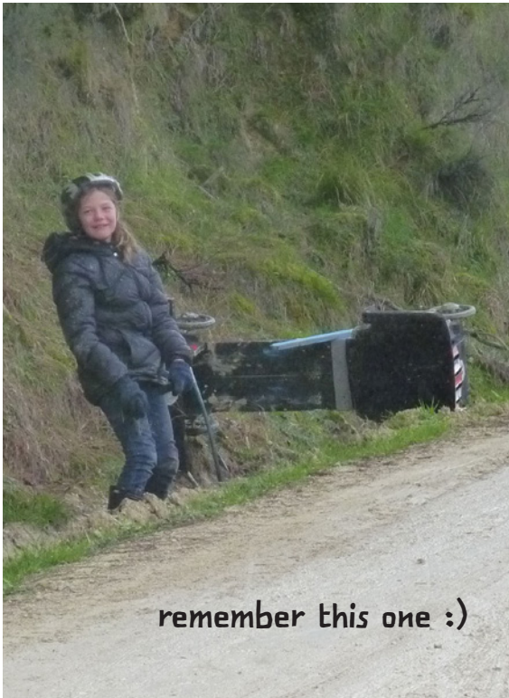
remember this one :)